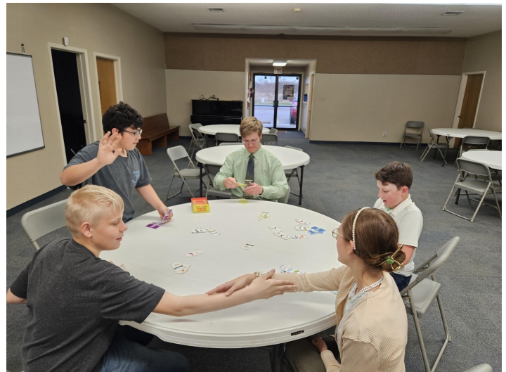
Youth Spring Break Game Break

**We are looking for service projects for the youth to work on to earn money for Youth Camp this summer. If you have work that needs to be done, contact Michael. Donations toward Youth Camp are appreciated, but not required for work.