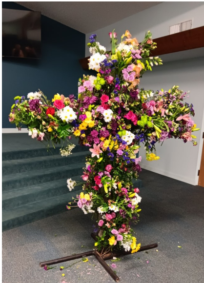
Flowering of the Cross