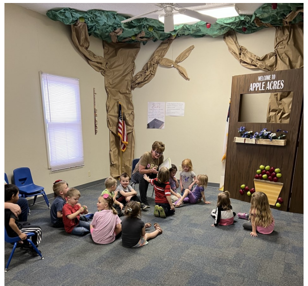
Cubbies learning about Jesus